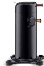
Low Side Shell