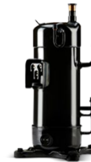
High Side Shell