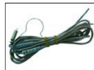
压缩机加热带(120W) Compressor heater band(120 W)