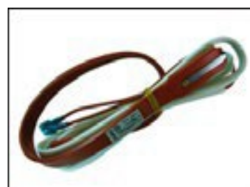
压缩机加热带(40W) Compressor heater band(40 W)