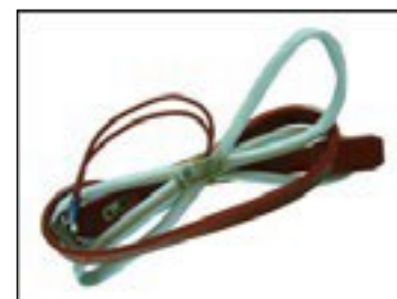
压缩机加热带(40W) Compressor heater band(40 W)