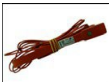
压缩机加热带(40W) Compressor heater band(40 W)