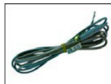
压缩机加热带(70W) Compressor heater band(70 W)