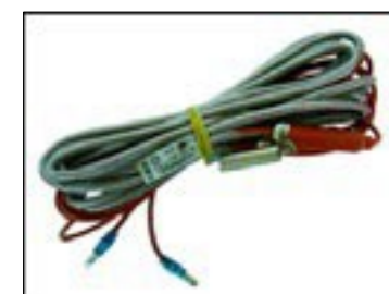
压缩机加热带(97W) Compressor heater band(97 W)