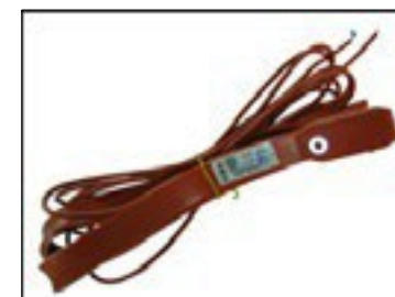
压缩机加热带(60W) Compressor heater band(60 W)