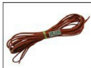
压缩机加热带(14W) Compressor heater band(14 W)