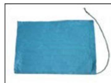
铝箔加热器(各种型号规格) Aluminum foil heater (all types)