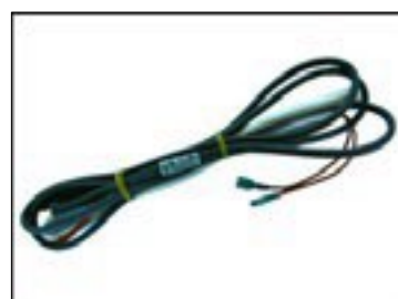
压缩机加热带(20W) Compressor heater band(20 W)