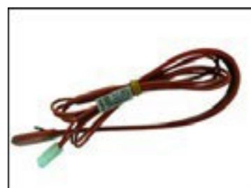
压缩机加热带(22W) Compressor heater band(22 W)