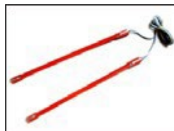
压缩机加热带(低功率) Compressor heater band(low power)