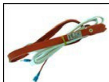
压缩机加热带(40W) Compressor heater band(40 W)