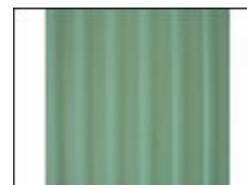
窗式空调器密封百叶(PVC) sealed window shade for window type air conditioner (PVC)