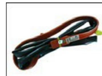
压缩机加热带(40W) Compressor heater band(40 W)