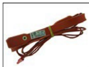
压缩机加热带(33W) Compressor heater band(33 W)